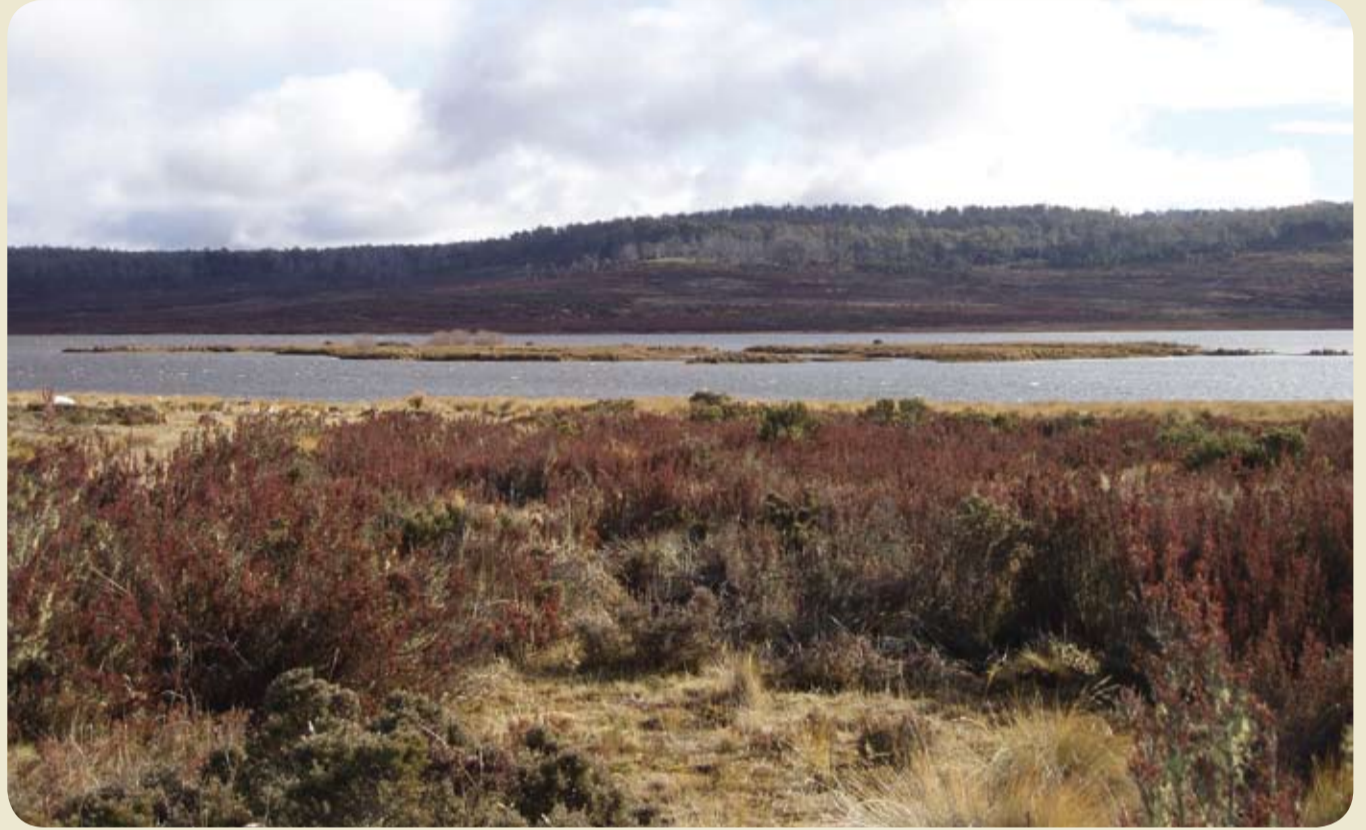
Brown trout illustration Kristii Melaine